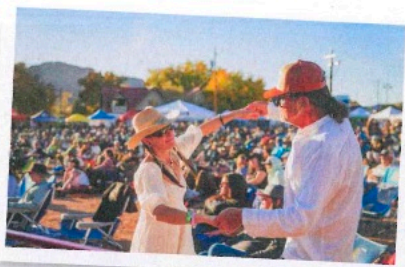
Moab offers a free concert series, left; Moab Folk Festival, above

the world's most photographed vistas, with the most surreal viewpoints from its Island in the Sky region.