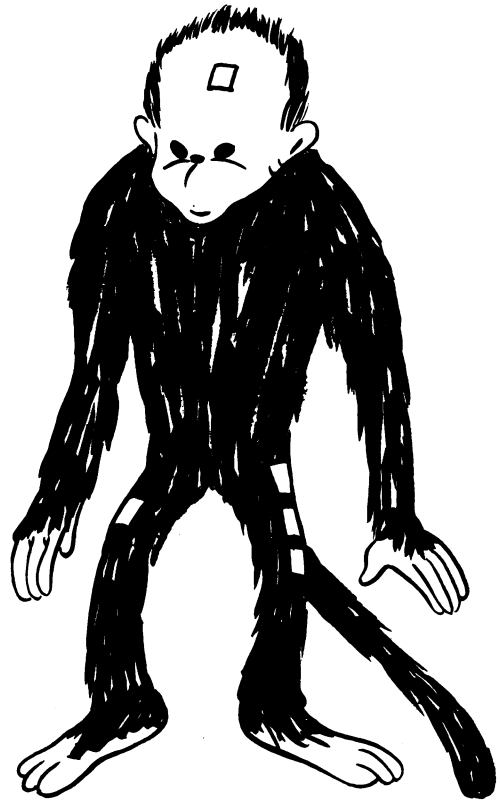
Figure 1. One square centimeter of skin was removed from the locations shown, three sites on the left thigh, one on the right thigh, and one on the head. Three days later poliovirus was injected into the base of the three lesions on the left thigh. Subsequent tests were made for local increase of virus and for spread of virus to the lesions on the right thigh and the head.

For our present purposes the most interesting studies were those with the "Iberia" strain of